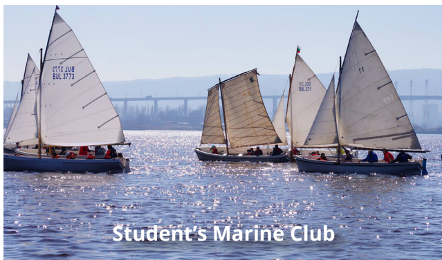
Student's Marine Club