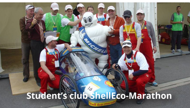
Student's club ShellEco-Marathon