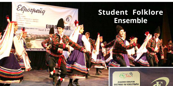
Student Folklore Ensemble